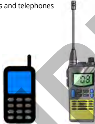
Radios and telephones