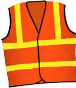
Personal protective equipment